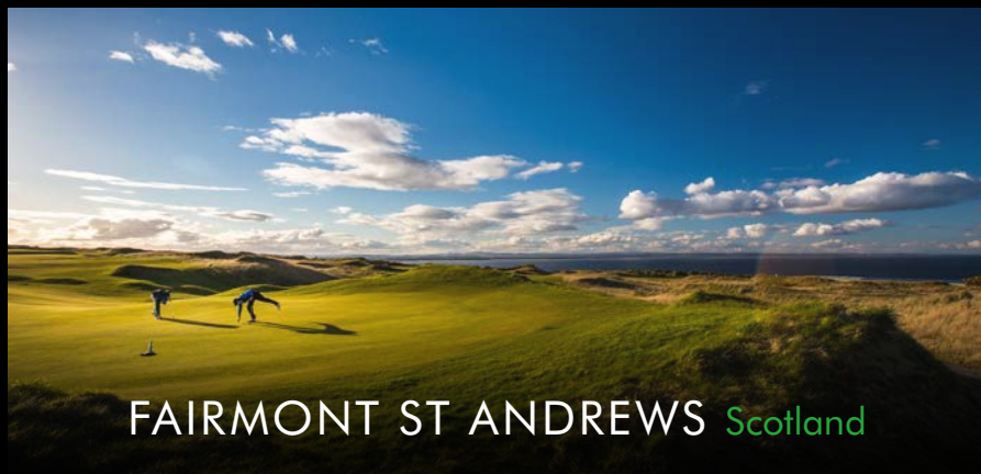
FAIRMONT ST ANDREWS Scotland

1 night DBB & 2 rounds of golf from £125 per person