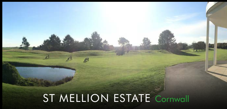
ST MELLION ESTATE Cornwall

1 night DBB & 2 rounds of golf from £128 per person