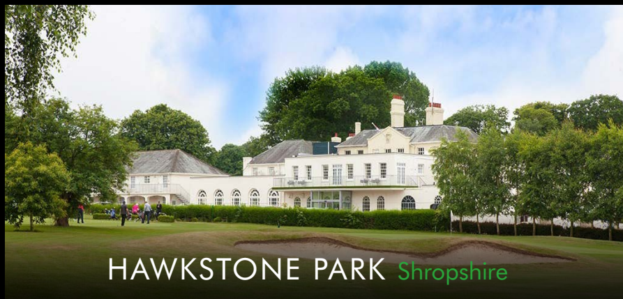
HAWKSTONE PARK Shropshire

1 night DBB & 2 rounds of golf from £128 per person