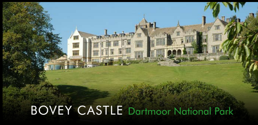
BOVEY CASTLE Dartmoor National Park

1 night DBB & 2 rounds of golf from £229 per person